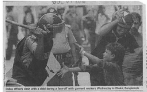
Police officers clash with a child during a face-off with garment workers Wednesday in Dhaka, Bangladesh.