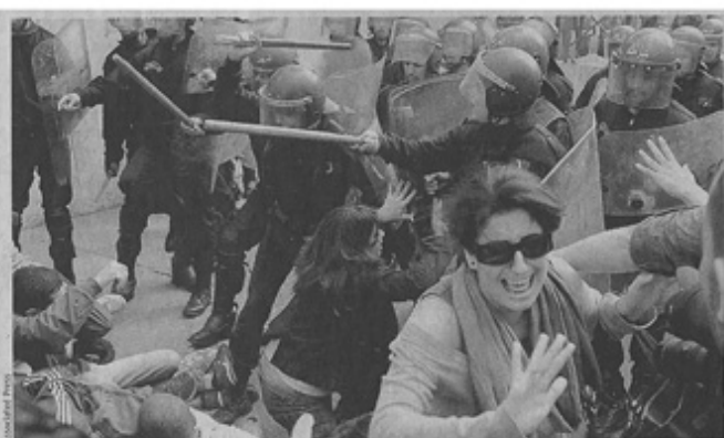
Police officers in Algiers crack down Tuesday on students who demanded more spending on universities and the