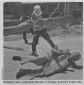
Protesters beat a policeman Monday in Srinagar, Kashmir's largest city.