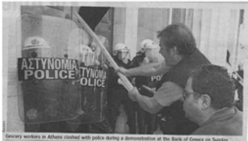
Greasy workers in Athens clashed with police during a demonstration at the Bank of Greece on Sunday.