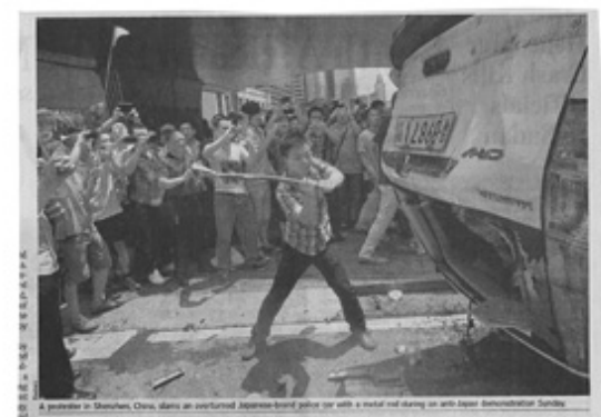
A protest in Shenzhen, China, shows an overfused Japanese-born police officer with a metal rod during an anti-Japan demonstration Sunday.