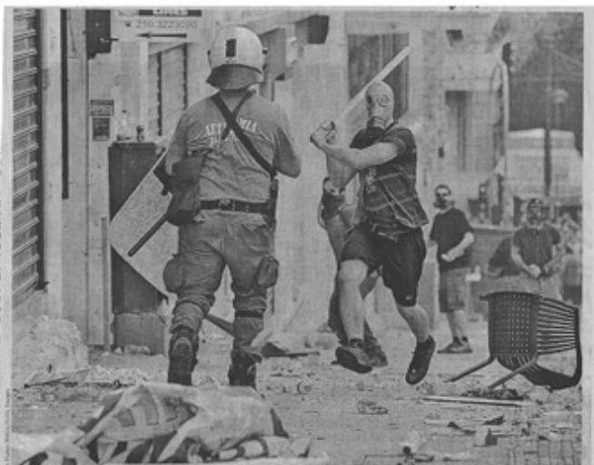
Protesters clash with riot police in Athens on Tuesday as lawmakers debated spending cuts and tax increases promised to international creditors.