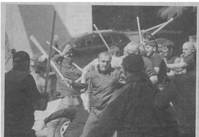
Protesters gathered in Tbilisi to call for the ouster of Georgia's president, Mikheil Saakashvili. The demonstration was largely peaceful, but there were some clashes among people with sticks.