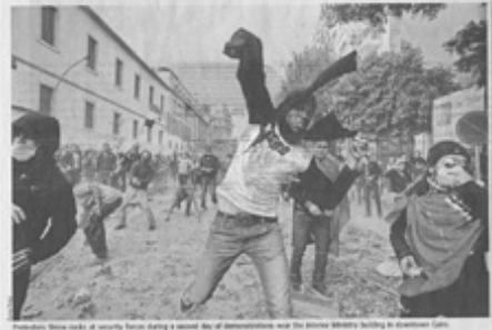
Protesters throw rocks at security forces during a second day of demonstrations near the former Ministry building in downtown Cairo.