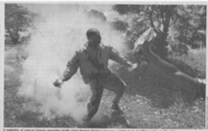
A protester shields himself from tear gas during a protest in Cairo Thursday.

ides why in, so re- istry story amon s the nder- long king at the it be y, of in al- s. "It may arch best f Pa- resi- work con- quib- i, so- 6, he rds are 7