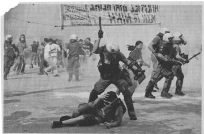
VIOLENCE IN ATHENS Protesters and police officers clashed Wednesday. Talks on a unity government in Greece foundered. Page B3.