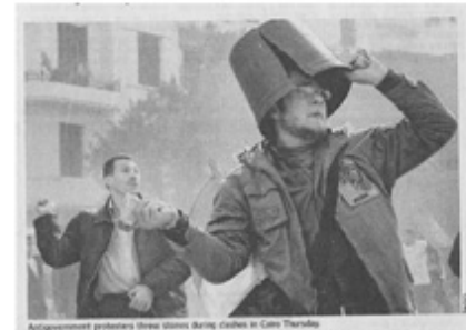
Protesters throw stones during clashes in Cairo Thursday.